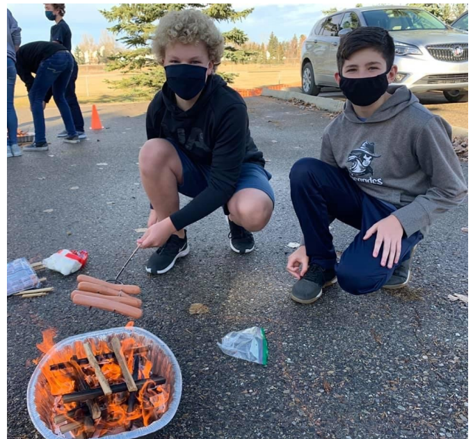
Outdoor Ed students practiced their fire building skills

We would like to say a big THANK YOU to Front Porch Realty for their recent donation to our Breakfast Program. We really appreciate their generosity!