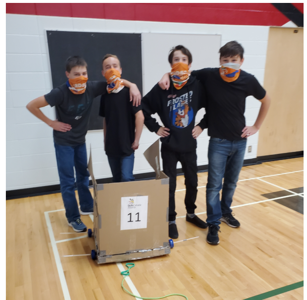
Westglen Spirit Games

Beginning in January, Chinook's Edge will be accepting Kindergarten registrations for the 2021-2022 school year. Children must turn five years old by December 31, 2021 to begin attending Kindergarten in the fall of 2021. Online registration will begin in early January – please visit our website at www.cesd73.ca for Kindergarten information, including the Chinook's Edge schools that offer Pre-Kindergarten programming.