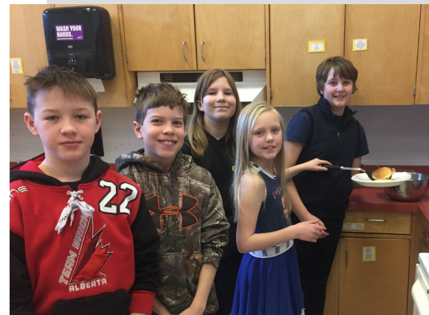
RIGHT: The 5C science class made pancakes while learning a hands-on approach to Classroom Chemistry