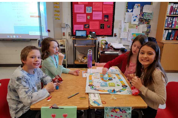
LEFT: Grade 5 students enjoyed visits from Junior Achievement volunteers learning about "Our Business World"