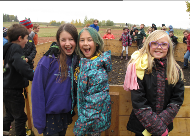
Turkey Trot was cold, but fun!