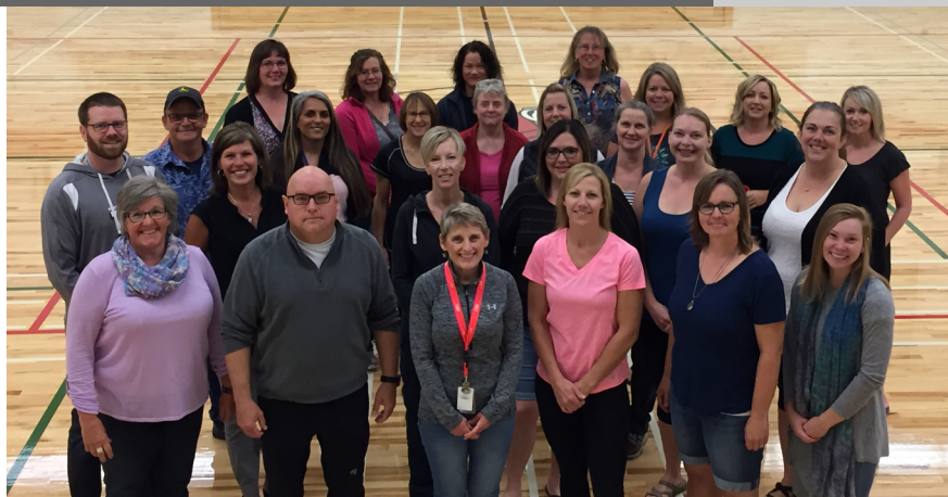
2018-19 Westglen Staff