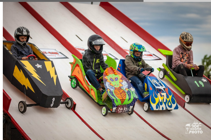
2018 Soap Box Derby

Westglen's annual Turkey Trot is on Monday, October 1st at 1:45pm. Students participate, by grade, in a cross country run. Prior to the run, students practice the course in PE and record their times. Before students run the Turkey Trot, we record the estimated time that they think they will complete the course in. The student in each grade who runs the course closest to their estimated time, wins a turkey (just in time for Thanksgiving!). The winners will be given a gift certificate to pick up their turkey at AG Foods. These will be presented at a celebration on Thursday, October 4th at 2:30pm. If you are able to volunteer on the day of the run, please contact the office. We need course officials and extra help timing.