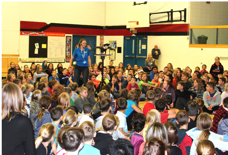
The Earth Rangers came to visit us on September 14th with live animal demonstrations, and spoke about the importance of protecting biodiversity while highlighting real conservation initiatives across Canada.