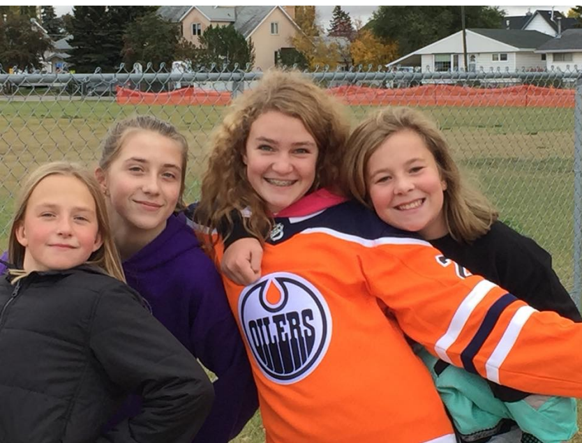
Left: Westglen students participated in the Didsbury Schools' Terry Fox Run on September 27th

With the legalization of cannabis expected to take effect on October 17, we want to be clear that cannabis is considered to be a restricted substance in our school division. Cannabis use, like alcohol use, is prohibited in all Chinook's Edge schools, on school property or during school related activities. Details are provided on Admin Procedure 3-11 'Student Substance Abuse', and it is important to note that infractions will result in serious consequences. October 17th will be no different than October 16th in terms of what is allowed in our schools. Thank you.